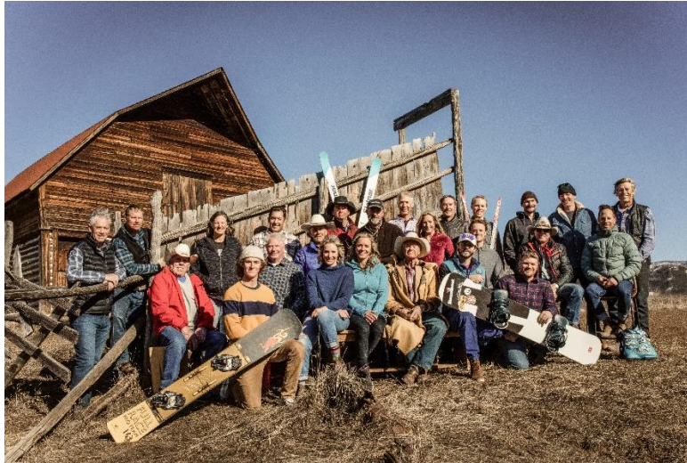
Steamboat Olympians, 2022

When winter athletes gather in Beijing in 2022, it's called the Winter Games. When Olympians gather in Steamboat, it's simply called Friday. Steamboat, known around the globe as Ski Town, U.S.A. ®, has more winter Olympians than any other town in North America: 100 and counting. In fact, Steamboat sent more athletes (13) to the 2022 Games than many small countries.